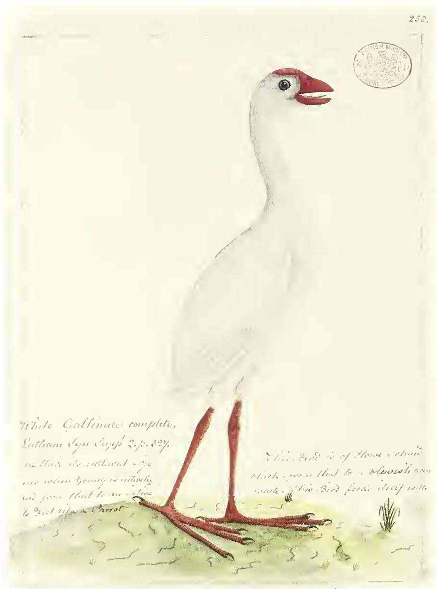
Figure 7. Illustration by an anonymous artist of a Lord Howe Gallinule Porphyrio albus from Thomas Watling's collection, NHMUK-L-Watling-329-M-1; the handwritten notes read 'This bird is of Lord Howe and when young is intirely [sic] black, from that to a bluish grey and from that to an intire [sic] white. The bird feeds itself with its feet like a parrot'

He made an ornithological report, the first survey of the avifauna of Lord Howe Island for 63 years, but did not mention the gallinule (Foulis 1853, Hindwood 1940). No doubt a poorly volant, chicken-sized gallinule quickly fell prey to whalers and sealers, and disappeared extremely rapidly, possibly even by the end of the 18th century. And, although Bassett-Hull (1909) hoped for its rediscovery, the confirmed existence of the Lord Howe Gallinule spanned just two years.